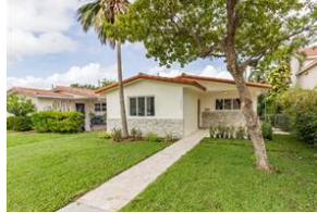
1433 Tyler St

MLS#: A10354070 Status: A Price: $439,000 SqFt: 1,860 Beds: 3 Bath: 2 (2 0)