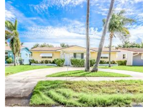
1013 N 13th Ave

MLS#: R10369029 Status: A Price: $379,000 SqFt: 1,782 Beds: 3 Bath: 2 (2 0)