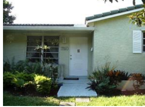
1250 Arthur St

MLS#: A10304177 Status: A Price: $435,000 SqFt: 1,626 Beds: 3 Bath: 2 (2 0)