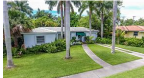
1244 Polk St

MLS#: A10335908 Status: A Price: $409,000 SqFt: 2,168 Beds: 4 Bath: 2 (2 0)