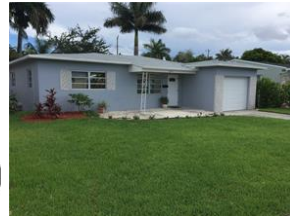
1434 Garfield St

MLS#: A10355793 Status: A Price: $545,000 SqFt: 1,731 Beds: 4 Bath: 3 (3 0)