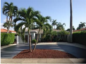
1435 JOHNSON ST

MLS#: A10294832 Status: A Price: $429,000 SqFt: 1,380 Beds: 3 Bath: 2 (2 0)