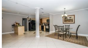
924 Johnson St

MLS#: A10303771 Status: A Price: $350,000 SqFt: 1,880 Beds: 3 Bath: 2 (2 0)