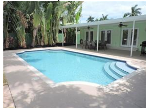
1411 Hayes St

MLS#: A10356628 Status: A Price: $495,000 SqFt: 1,536 Beds: 3 Bath: 1 (1 0)