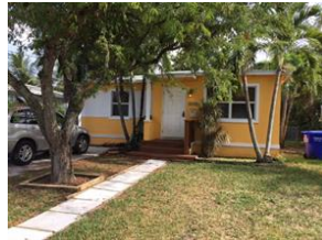
1538 Garfield St

MLS#: F10059417 Status: CS Price: $345,000 SqFt: Beds: 3 Bath: 2 (2 0)