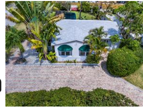
1539 Grant St

MLS#: F10064593 Status: CS Price: $318,000 SqFt: Beds: 2 Bath: 2 (2 0)