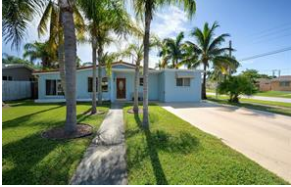
1124 N 13th Ter

MLS#: F10090118 Status: A Price: $420,000 SqFt: Beds: 3 Bath: 2 (2 0)