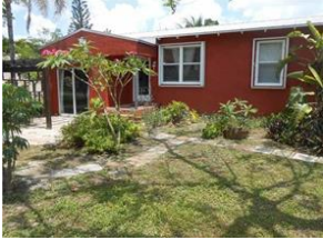
1633 Mckinley St