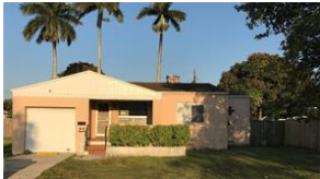
1613 N 16th Ct