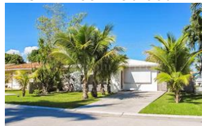
1139 Lincoln Street

MLS#: F10063156 Status: CS Price: $329,000 SqFt: Beds: 3 Bath: 2 (2 0)