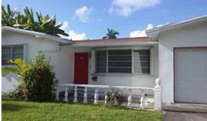
1042 Johnson St

MLS#: F10083488 Status: A Price: $499,900 SqFt: Beds: 3 Bath: 2 (2 0)