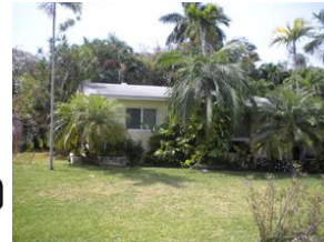
1426 Arthur St

MLS#: F10052353 Status: CS Price: $365,000 SqFt: Beds: 2 Bath: 2 (2 0)