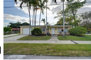
930 N 11th Ct

MLS#: H10253114 Status: CS Price: $255,000 SqFt: 1,096 Beds: 2 Bath: 1 (1 0)