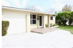
1721 N 16 Ct

MLS#: A10213833 Status: CS Price: $307,000 SqFt: Beds: 3 Bath: 2 (2 0)