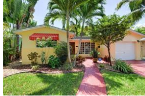
1240 Pierce St

MLS#: F10090469 Status: A Price: $447,000 SqFt: Beds: 3 Bath: 2 (2 0)