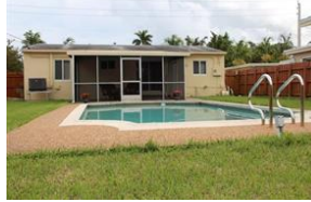
1415 Garfield St

MLS#: A10363721 Status: A Price: $499,000 SqFt: 2,368 Beds: 3 Bath: 2 (2 0)