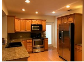
1640 Cleveland Street

MLS#: A10340969 Status: A Price: $335,000 SqFt: 1,483 Beds: 3 Bath: 3 (2 1)