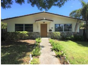
1120 Johnson St

MLS#: A10246587 Status: CS Price: $199,900 SqFt: 1,414 Beds: 2 Bath: 1 (1 0)