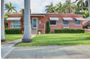
1315 Hollywood Boulevard

MLS#: A10301703 Status: CS Price: $292,500 SqFt: 1,565 Beds: 3 Bath: 2 (2 0)