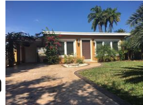
1441 Grant St

MLS#: F10061683 Status: CS Price: $330,000 SqFt: Beds: 3 Bath: 2 (2 0)